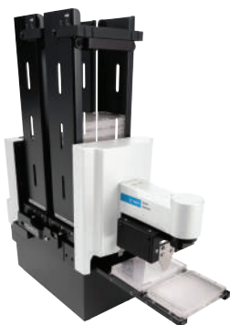
Figure 1. Epoch R configuration is compatible with the Agilent BioTek BioStack microplate stacker.

For the budget-conscious laboratory focused on important nucleic acid and protein quantification as well as standard ELISA and other colorimetric assays, the Epoch offers unsurpassed versatility. To further automate the process, the Agilent BioTek BioStack microplate stacker can be integrated with an optional robot-compatible Epoch model.