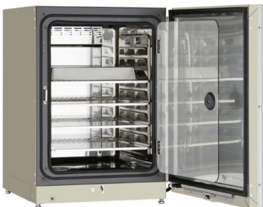
MCO-170AICD setup for Dual Heat Sterilisation