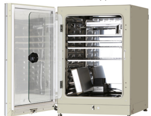
MCO-170AIC setup for H 2 O 2 Decontamination